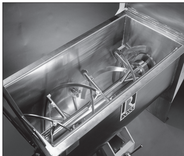
The clean design and finish of a Ross Blender produces faster blending cycles, thorough discharge, and easier clean-up.

Check out our blender prices – the lowest you'll find anywhere.