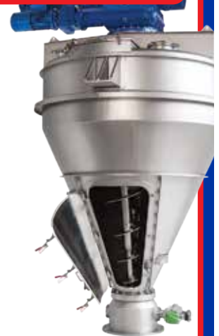
Vrieco-Nauta Vitomix® Mixer