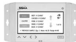
We have a wireless machine interface device for any application