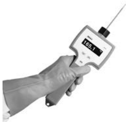
CP-90 Wireless Temp Probe