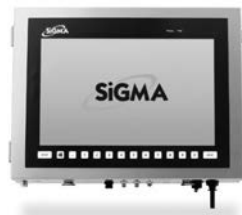
Our complete line of NEMA 4 washdown PCs and PC enclosures