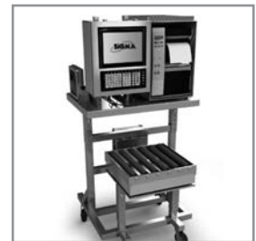
Complete In-House Fab capabilities-Carts, Mounts, Pedestals and conveyor systems

Please contact us for Further Information: