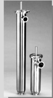
Side Inlet Strainers (Short & Long)

SaniClean's Inline and Side Inlet Sanitary Strainers are dimensionally interchangeable, and their component parts: perforated support cores, springs, and distributor caps are all interchangeable with many of the standard models currently on the market. Our Wire Mesh OverScreens are made for a snug slip fit over the perforated support core. These OverScreens feature continuously welded seams - no loose wires.