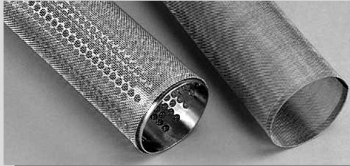
Wire Mesh OverScreens and Perforated Support Cores