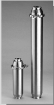
Inline Strainers (Short & Long)