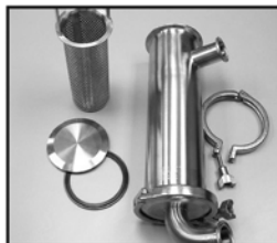
Basket Strainer with Elbow Outlet.