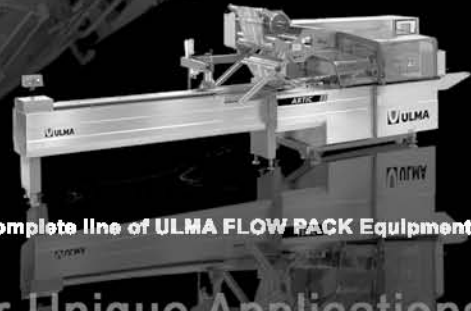
Complete line of ULMA FLOW PACK Equipment

Thermoforming • Tray Sealing • Meal Assembly • Dosing H/F/F/S • V/F/F/S • Side Seal • Sleeve Wrap • Robotics Forming • Erecting • Flow Pack • Blister • Skin Pack Vacuum • Shrink Wrap • Closing • Cartoning • Case Packaging • Retail Ready