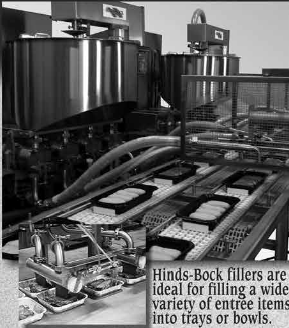
Hinds-Bock fillers are ideal for filling a wide variety of entree items into trays or bowls.