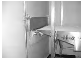
Same Blast Freezer with APS