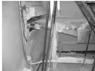
Typical Blast Freezer lower opening