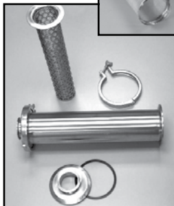
Custom Inline Strainer.

Custom Hi-Capacity Basket Strainer - 3.8 s/f basket area with bevel seat connections and a swing bolt top cover; pressure tested to 300 psi.