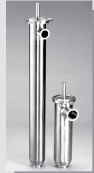
Side Inlet Strainers (Short & Long)

SaniClean's Inline and Side Inlet Sanitary Strainers are dimensionally interchangeable, and their component parts: perforated support cores, springs, and distributor caps are all interchangeable with many of the standard models currently on the market. Our Wire Mesh OverScreens are made for a snug slip fit over the perforated support core. These OverScreens feature continuously welded seams - no loose wires.