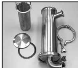
Basket Strainer with Elbow Outlet.