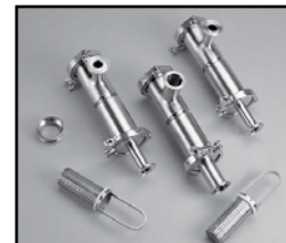
S15 Basket Strainer.

SaniClean Basket Strainers are manufactured to "standard" sizes, configurations and capacities, or they can be "customized" to suit your specific requirements.