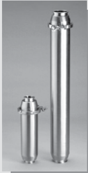
Inline Strainers (Short & Long)