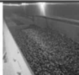
IQF Tunnel Freezer