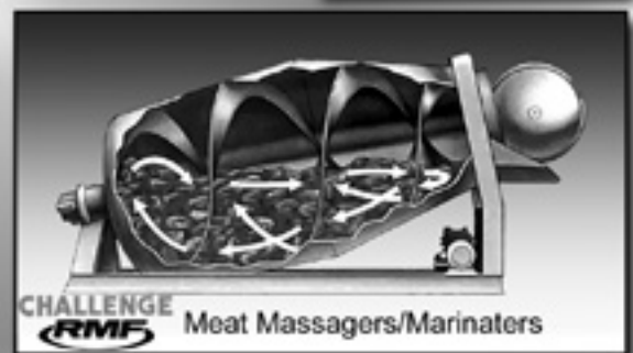
CHALLENGE RMF Meat Massagers/Marinaters