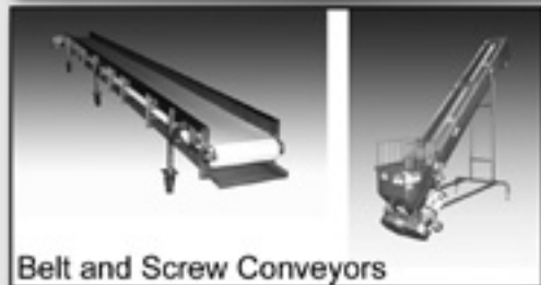
Belt and Screw Conveyors