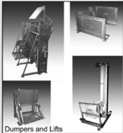
Dumpers and Lifts