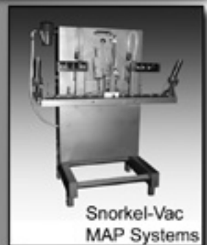
Snorkel-Vac MAP Systems