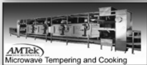
AMTek Microwave Tempering and Cooking