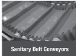
Sanitary Belt Conveyors