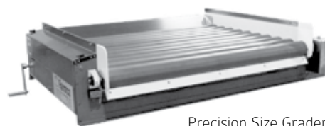
Precision Size Grader