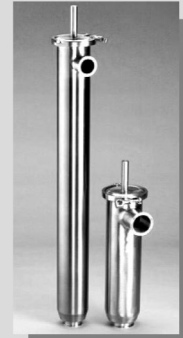
Side Inlet Strainers (Short & Long)

SaniClean's Inline and Side Inlet Sanitary Strainers are dimensionally interchangeable, and their component parts: perforated support cores, springs, and distributor caps are all interchangeable with many of the standard models currently on the market. Our Wire Mesh OverScreens are made for a snug slip fit over the perforated support core. These OverScreens feature continuously welded seams - no loose wires.