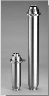
Inline Strainers (Short & Long)