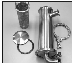
Basket Strainer with Elbow Outlet.