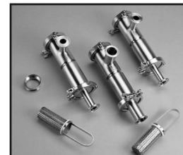
S15 Basket Strainer.

SaniClean Basket Strainers are manufactured to "standard" sizes, configurations and capacities, or they can be "customized" to suit your specific requirements.