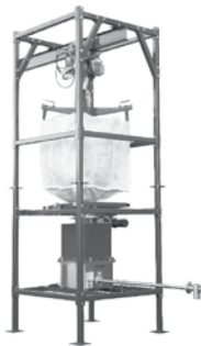
Bulk Bag Unloaders