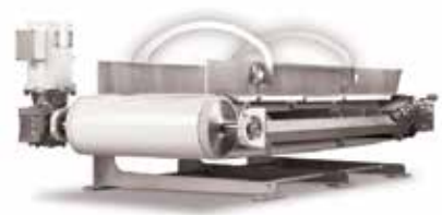
WF18 Sanitary Weigh Belt Feeders