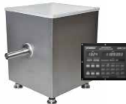
Gravimetric Feeders with GRC32 Processors